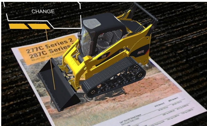
Fig. 1. An example of using Vuforia in the professional training of future mining engineers

The enumerated augmented reality libraries give the wide possibilities for the designer, beginning from the different operational systems support ending the deployed instrument kit, which identifies and snoops the objects. Proceeding from the produced requirements for the augmented reality technologies, it becomes obvious to prefer library's using. The library will require the minimal resources investment from the financial point of view and from the point of view of design's complication. The augmented reality platform Vuforia corresponds the set requirements among the above-mentioned libraries most of all. Free version availability will allow shortening the financial costs, and Unity support will allow working out software program application, which will support all set of Unity platforms. It simplifies the process of working out and this system supporting (Fig. 1).