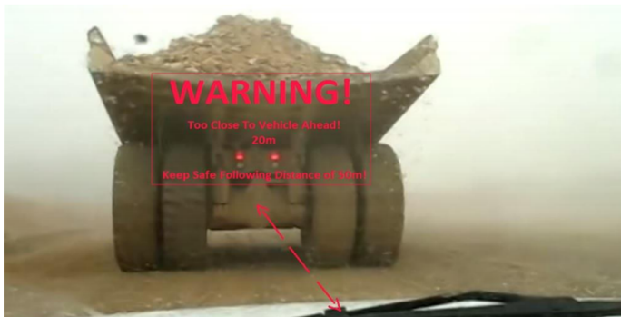
Fig. 6. Real-time augmented reality information in vehicles