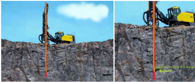
Fig. 2. Augmented drill hole with indicated deflection on the drill head