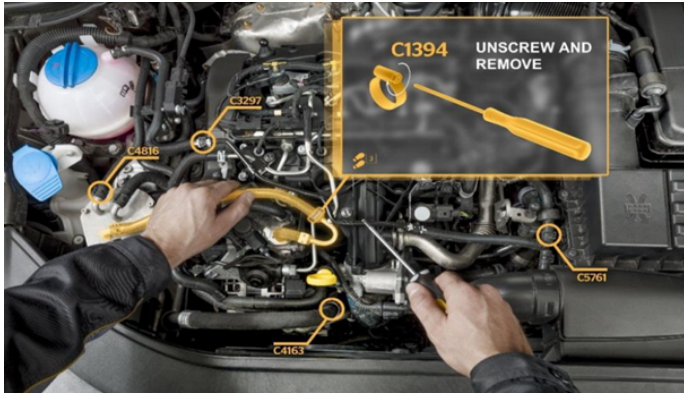
Fig. 5. Augmented maintenance on an engine

assistance can be provided to perform effective inspections in order to reduce the risk of unscheduled maintenance requirements (Fig. 5).