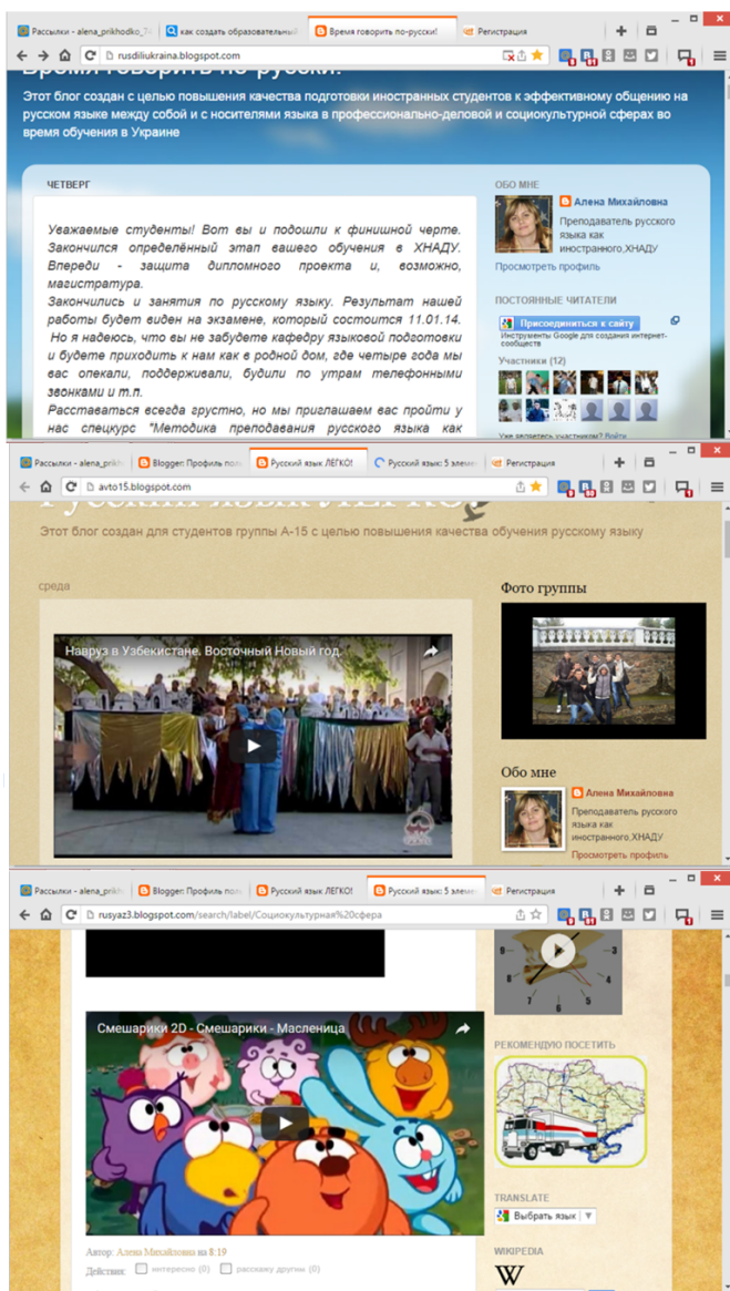
Fig. 1. Exemplary screenshots of educational blogs